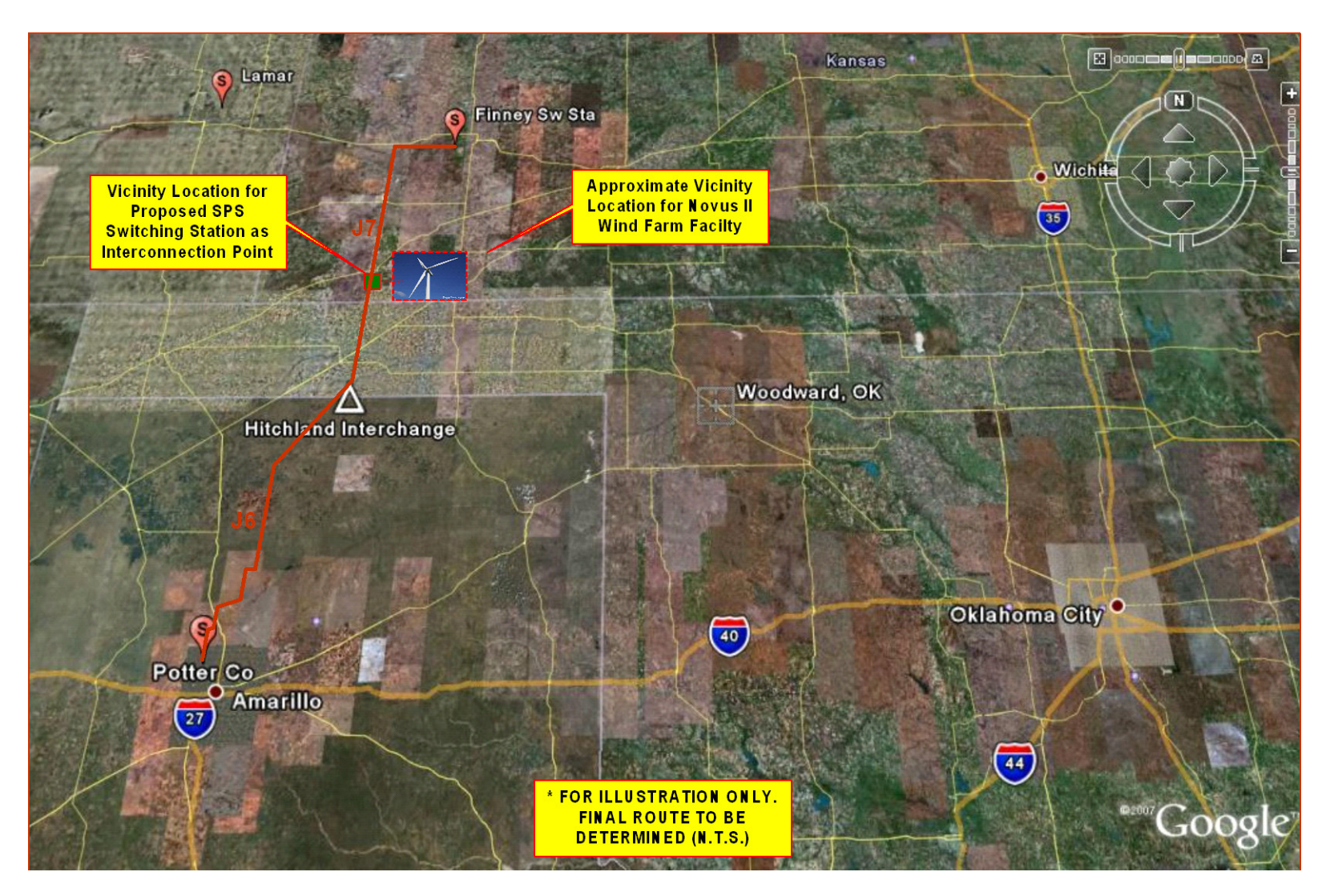
Figure A-1 Approximate location of proposed SPS Switching Station and Wind Farm Facility