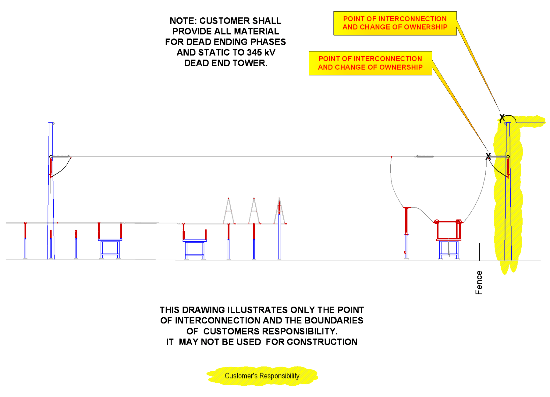
Figure A- 3 Point of Interconnection & Change of Ownership (Typical)